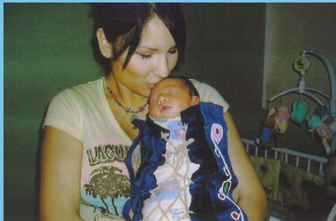
Sunggled in a Moss Bag V. Mc. 2007

Photovoice, founded on a philosophy of collaboration, empowerment and creative self-expression, is a method that promises possibilities and opportunities. By combining rich research data, photography, stories, critical reflection, group efforts, social change, and increased awareness of personal and community issues, this is a truly innovative activity well suited to many.